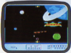
CATCHING ENERGY PACK