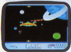
MOTHER SHIP ARRIVING

When your Spectron is about to run out of fuel, your Mother Ship will appear, preceded by several musical notes. When this ship appears, be prepared to intercept the Energy Pack that will be dropped by parachute. In order to refuel, you must catch this pack by moving your Base Laser so that it is directly below.