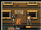
MOTOR CITY SHOW DOWN!