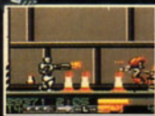
BLAST OCP'S FLYING DROIDS.

Armed with a laser-gun, flame-thrower & missile launcher multi-weapon attachments, RoboCop must destroy giant ED-209's and OCP's latest techno warrior... OTOMO!